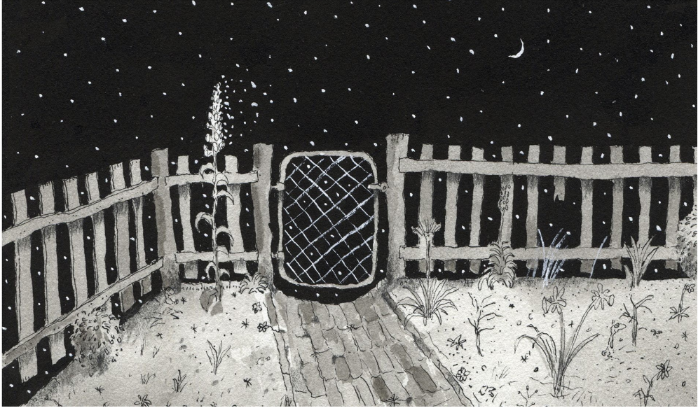
Garden Gate by Michael Leunig

Our Mission: Growing in Spirit Living as Disciples Serving God's World